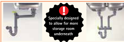
Single Bowl Basket kit