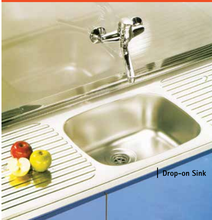
| Drop-on Sink